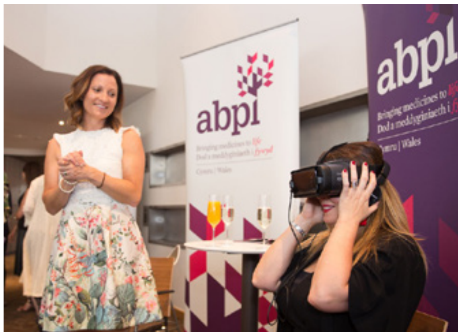
ABPI Cymru Wales took the opportunity to launch the VR experience in Wales at the Womenspire 2018 Awards