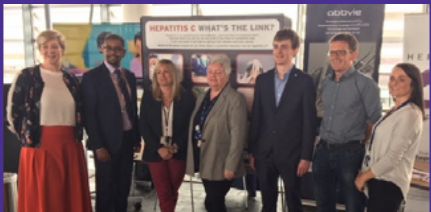
Cabinet Secretary for Health and Social Services, Vaughan Gething AM, visits Assembly exhibit on Hepatitis C.

▶ You can watch the video at: www.youtube.com/watch?v=b7v4-43hBo0