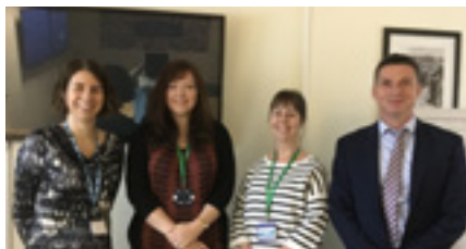
Members of Velindre NHS University Trust and Novartis; Working Together

The Velindre Cancer Centre provides services to over 1.5 million people across South East Wales and beyond. Each year the cancer centre treats over 5,000 new referrals and around 50,000 new outpatients. 1