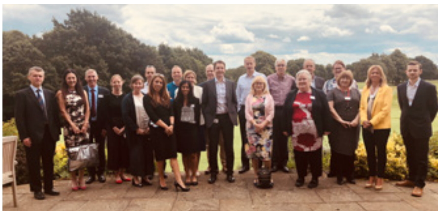
Representatives from the Midland & Wales ATTC, Innovate UK and the Cell and Gene Therapy Catapult at a programme review meeting June 2018.

A consortium, the Midlands & Wales Advanced Therapy Treatment Centre – jointly led by the Welsh Blood Service (on behalf of NHS Wales) and the NIHR Birmingham Biomedical Research Centre, was successful in securing one of the three awards and £7.3m in grant funding.