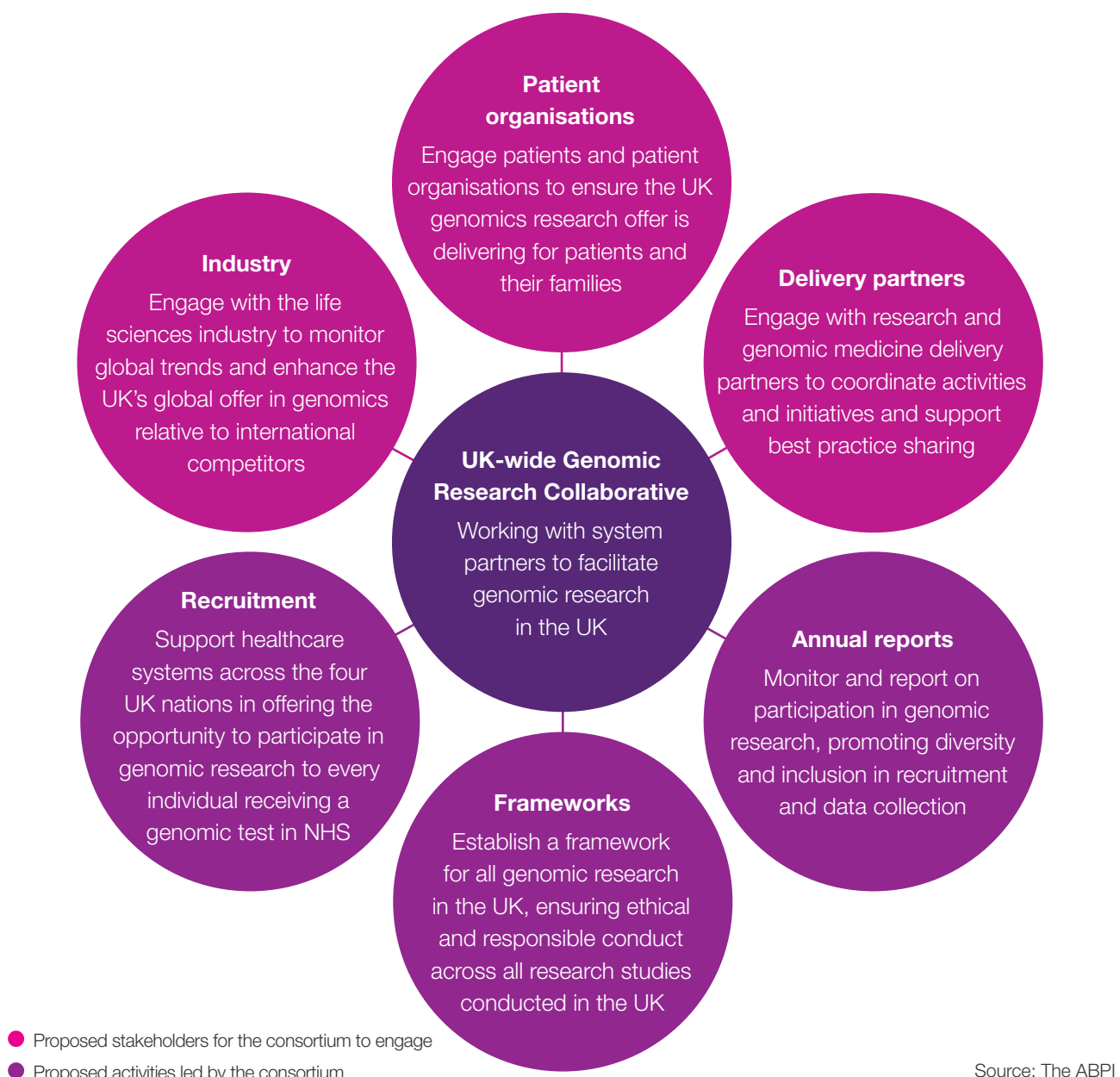
Figure 2. A proposed national approach for genomic-enabled research and development